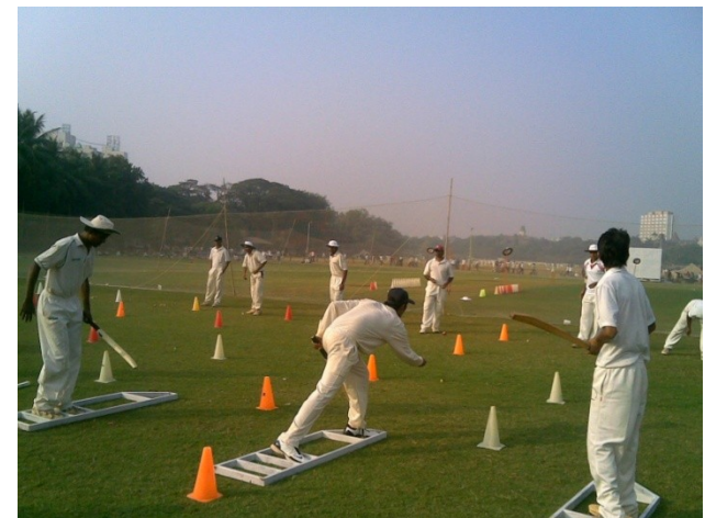
WCA trainees using batting matrix during the batting session