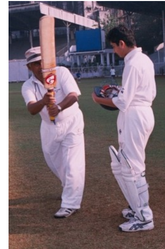
WCA trainees with Late Hon. Hanumant Singhji