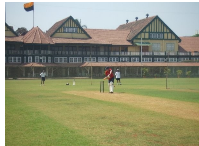
Bombay Gymkhana - Mumbai