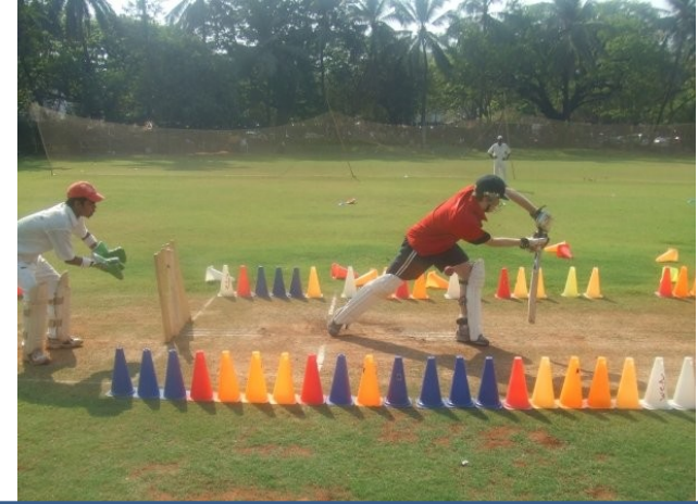
The WCA special learning sessions with special learning equipments