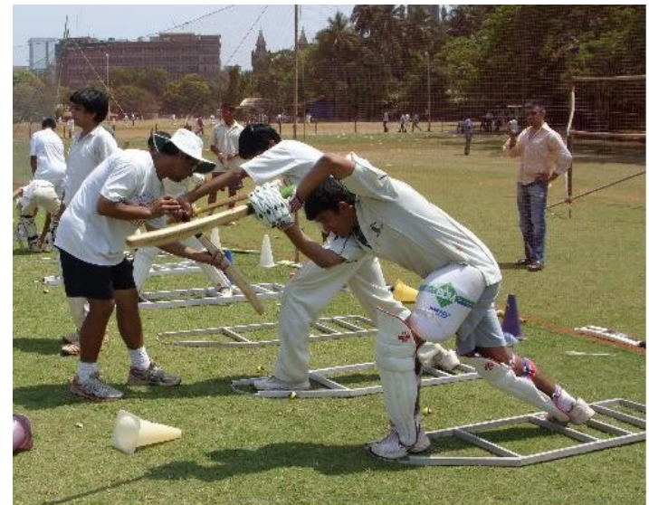
WCA trainees using batting matrix during the batting session