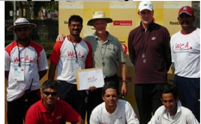
WCA TEAM with Greg Chappell during the Cricket Star