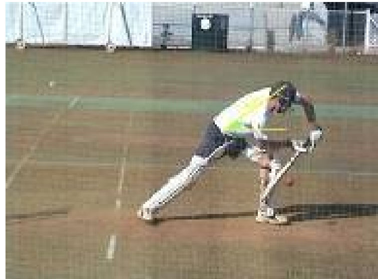
WCA Alumnus - Andrew Strauss (Middlesex & England)