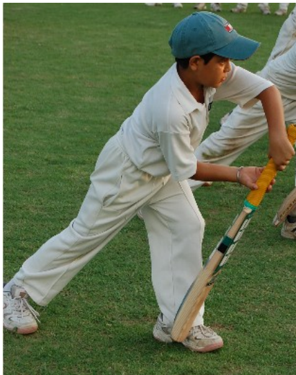
WCA young trainee during the batting session